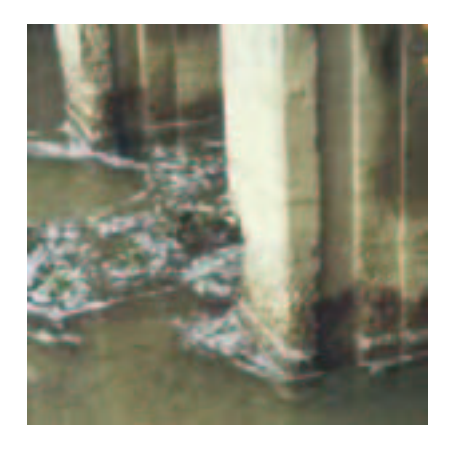
Figure 3. Corroded concrete due to sulphuric acid [nrm, 2002].