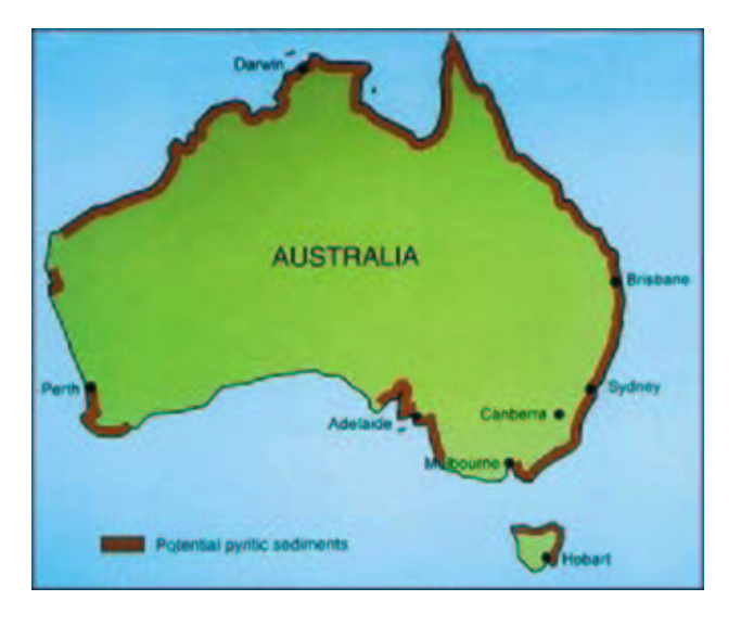
Figure 1. Coastal acid sulphate soils in Australia. (original source, National Strategy for the Management of Coastal Acid Sulphate Soils, January 2000) [deh, 2004].